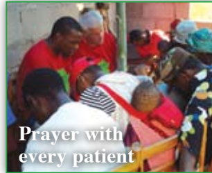
Prayer with every patient

The Lord raises the poor from the dust — yes, from a pile of ashes! He treats them like princes, placing them in seats of honor. - 1 Samuel 2:8