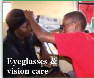
Eyeglasses & vision care