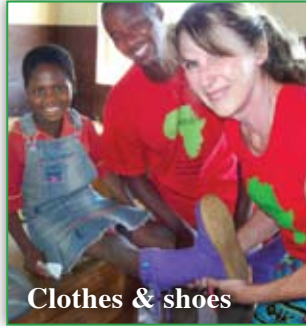
Clothes & shoes