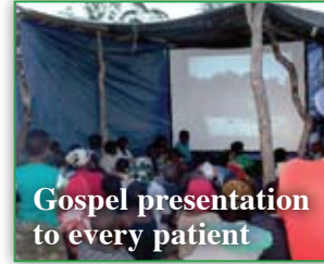
Gospel presentation to every patient