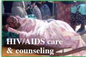
HIV/AIDS care & counseling